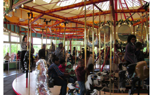
A public kickoff forum was held in August 2012 to share initial goals and ideas. At the April 2013 Carousel rededication, the PLG shared a draft vision statement for public input.